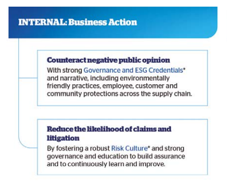
Fig 5: Key solutions to managing social inflation. *QBE customers have access to profiling tools for evaluating both Risk Culture and ESG.

Deborah O'Riordan is Financial Lines Practice Leader at QBE Europe